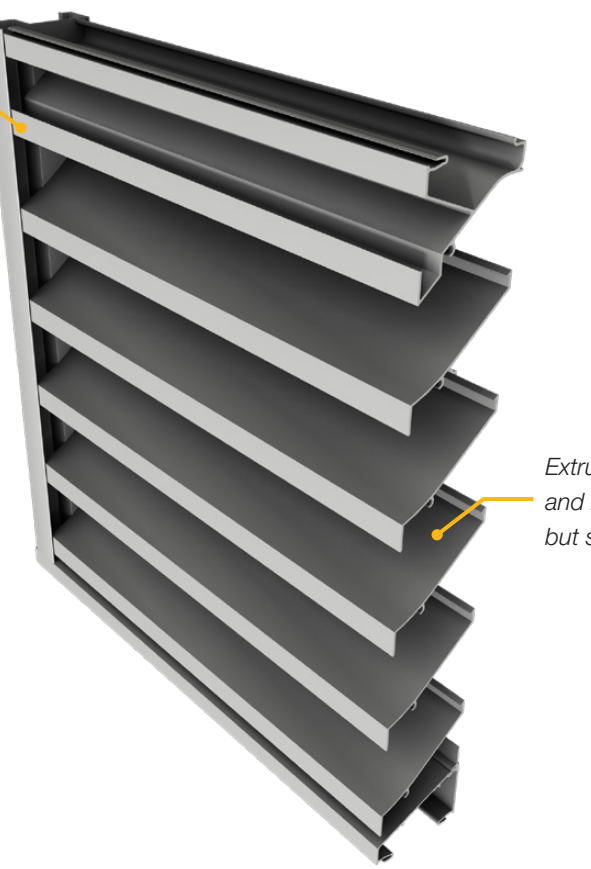
Extruded aluminum frame and blades for lightweight but sturdy construction

Jamb gutters and architectural blade profile create a streamlined appearance